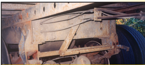
A typical rust damaged frame.