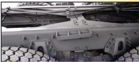
ARMOUR-SEAL protected frame.

Highly corrosive deicers such as salt, liquid calcium, and mag chloride may be great at melting ice and snow, but they attack the frames, fuel tanks, oil pans, brake cables, and wiring harnesses of your expensive fleet.