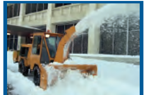
Apply new SNO-FLO™ to your augers and blower chutes to prevent sticking!