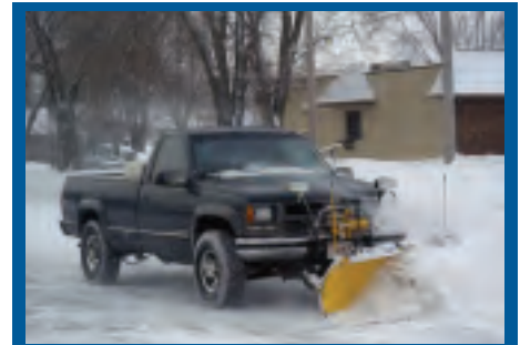
High moisture content snow slides right off your plow with new SNO-FLO™!