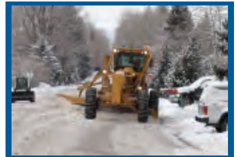
New SNO-FLO™ keeps wet snow from sticking to your grader blades!