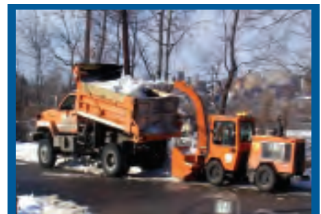
Wet snow and ice slush slide right out of your truck bed with new SNO-FLO™!